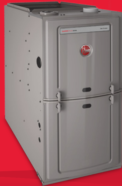
Classic Plus™ Series R801T / R802P