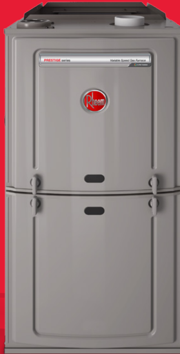
Prestige™ Series R802V