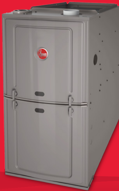
Classic® Series R801S / R801P

We took it a step further and delivered “PlusOne™” advantages – unique Rheem innovations designed to make your job easier while providing homeowners with the ultimate home comfort experience.